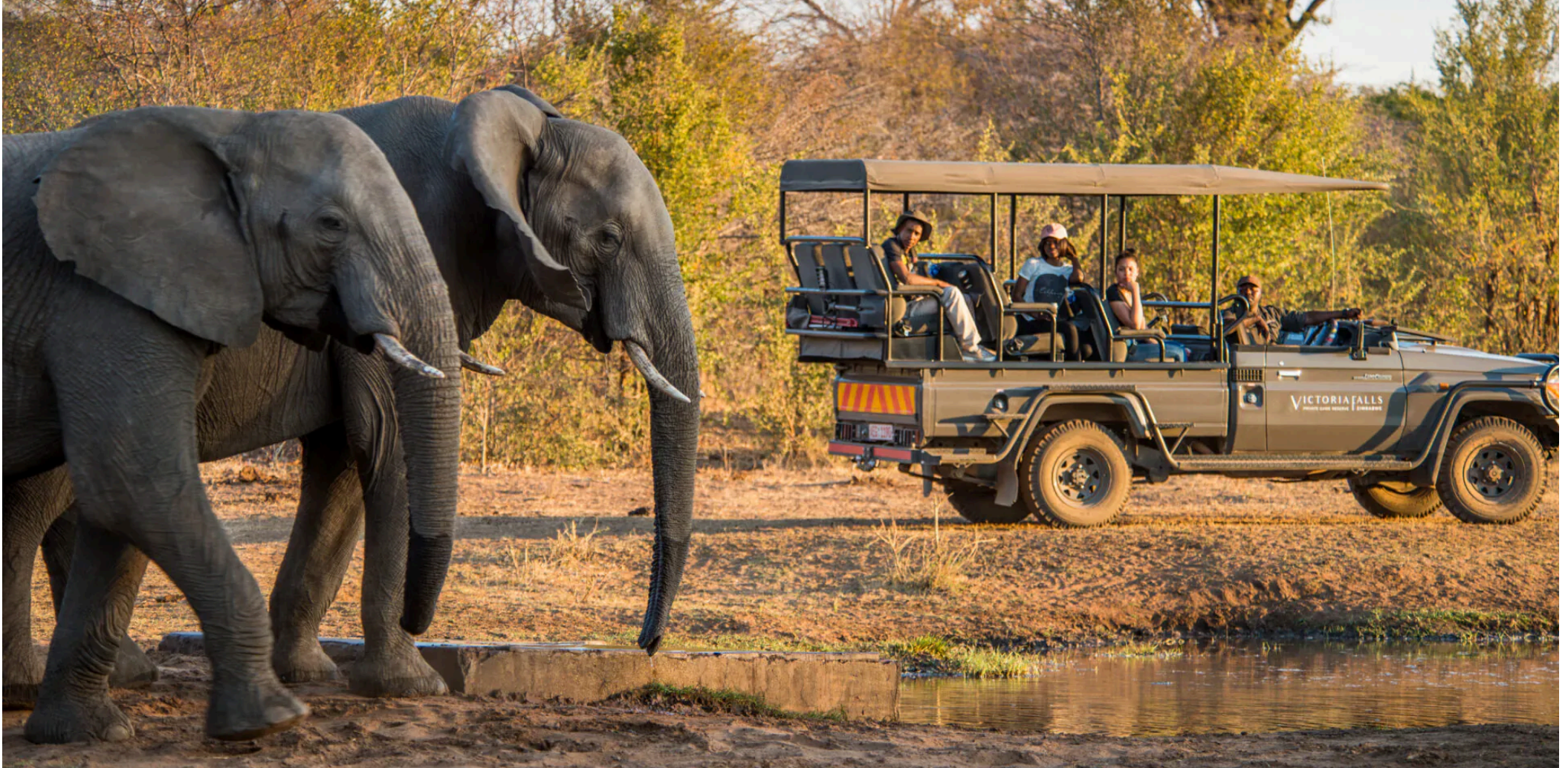
Stanley & Livingstone Boutique Hotel – a 5- star colonial gem at Victoria Falls, Zimbabwe