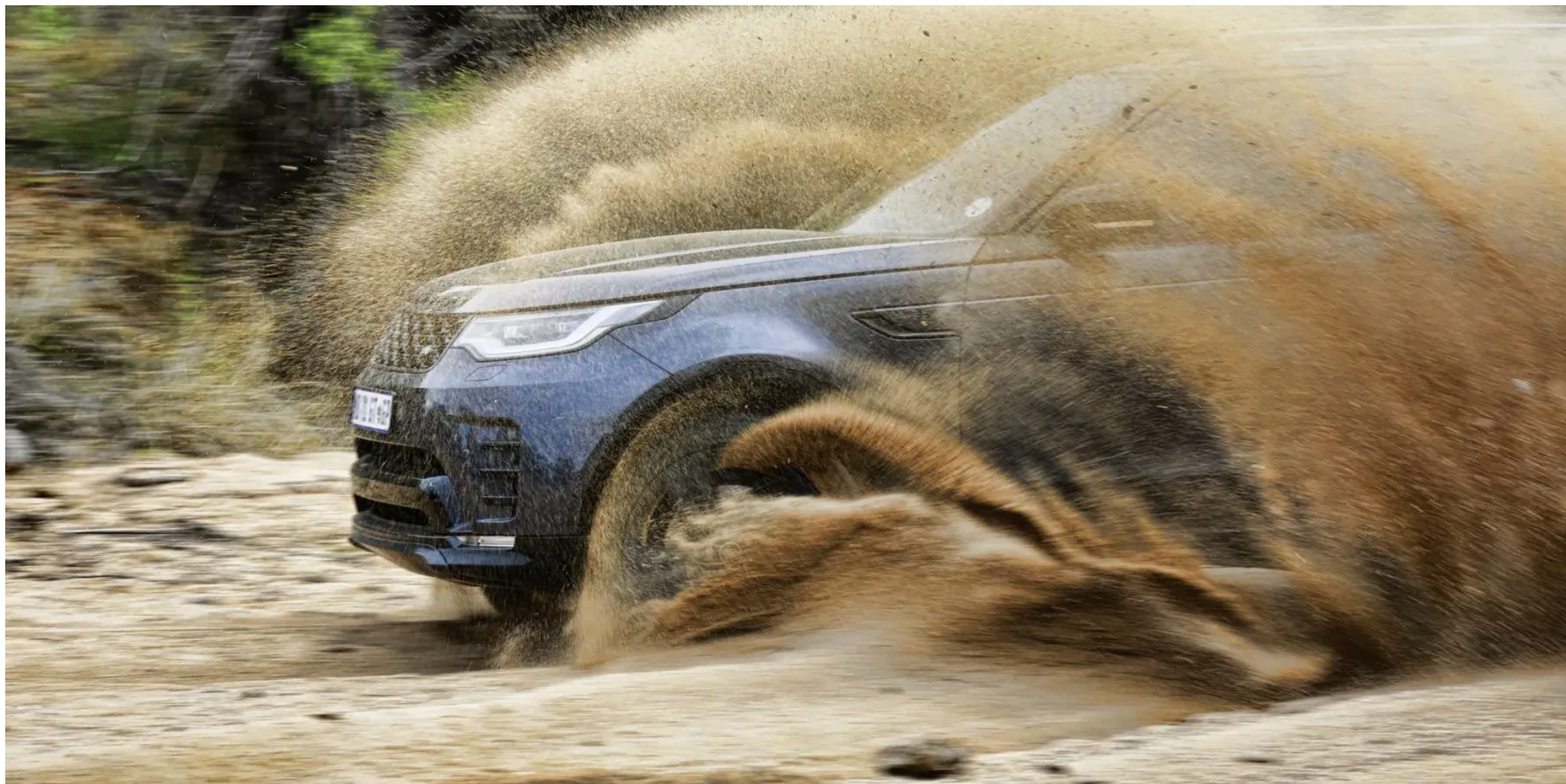
Land Rover's Discovery D350 HSE a luxury SUV: The Civilised Colossus