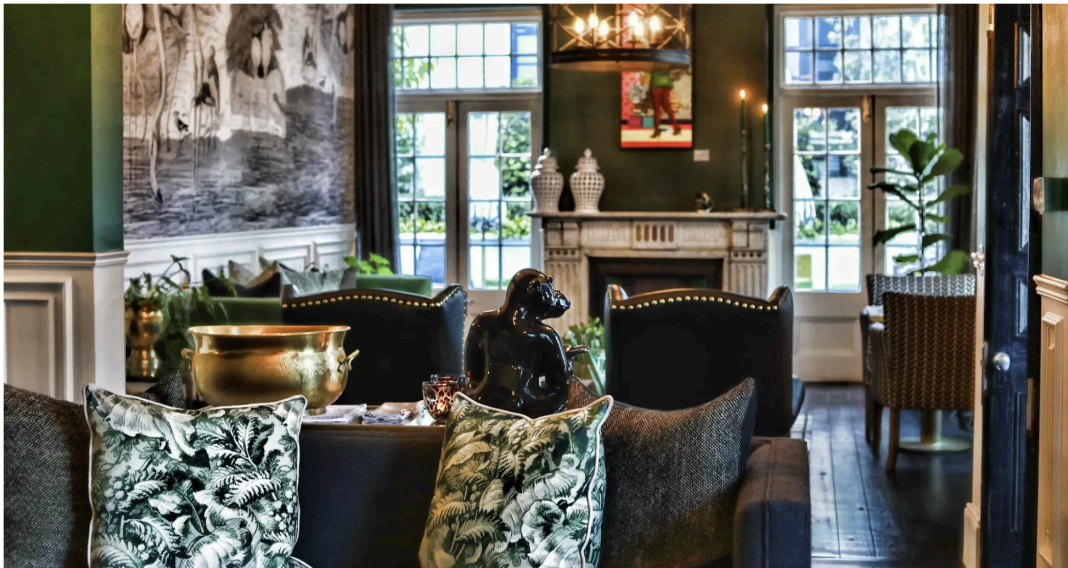
Between Table Mountain Cape Town and Quiet Streets